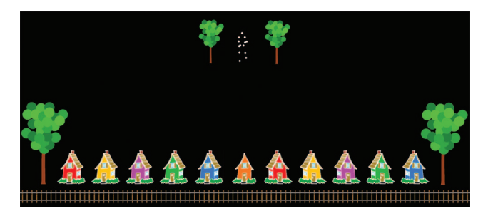
Figure 1. Example of a point-light walker (with a -18^{\circ} heading) and response options. For display purposes, the dimensions of the stimuli are close to but do not exactly match the dimensions from the actual experiment.

To evaluate heading sensitivity, we asked observers to make predictive judgments about a walker's heading. We created a cartoon scene that included a row of 11 equally spaced cartoon "train stations" and railroad tracks along the bottom of the screen along with linear perspective cues (trees with receding size) that created the impression of depth (see Figure 1). Train stations (1.71^{\circ} \times 2.01^{\circ}) were identical cartoon images of a house, with the exception that the stations were given different colors. Stations to the left and right of the center station were mirror-image-reversed profile views so as to give the impression of perspective. The